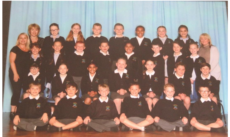
Colney Heath School & Nursery ~ 2017