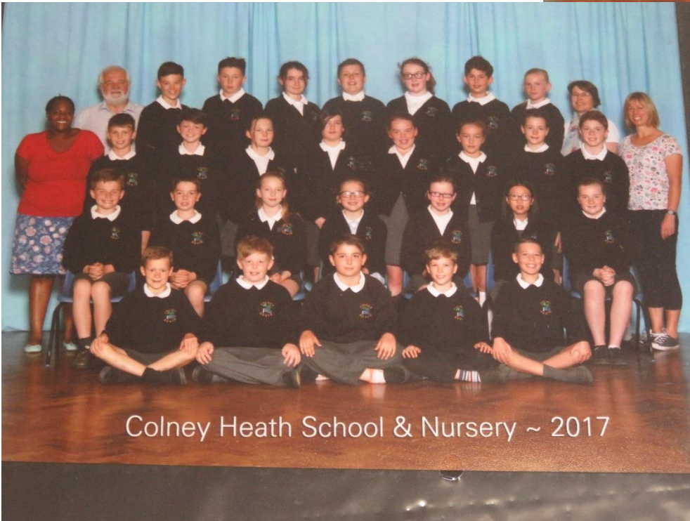
Colney Heath School & Nursery ~ 2017