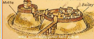
11TH Century MOTTE AND BAILEY CASTLE WITH WOODEN WALLS