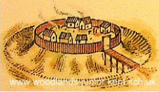
10TH Century SAXON DITCH AND RAMPART CASTLE WITH WOODEN FENCES