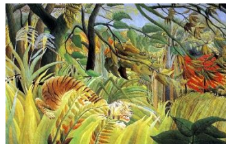
Tiger in Tropical Storm (Surprised!) 1891