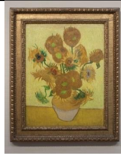
Sunflowers by Vincent Van Gogh 1888