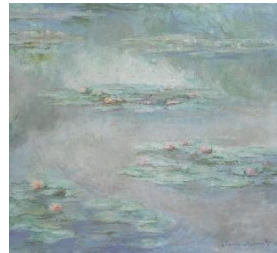
Claude Monet 1840-1926