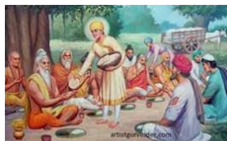
The Emperor and the Langar