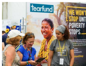
Christian charity fund