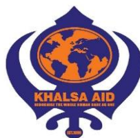
Khalsa aid charity