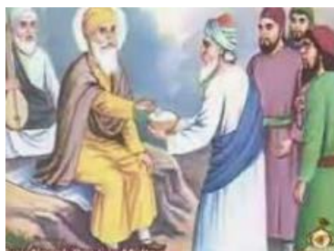
The milk and the Jasmine flower story