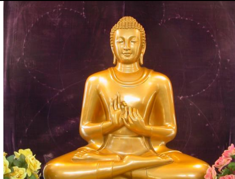
Buddhist Rupa showing the mudra (gesture) of teaching