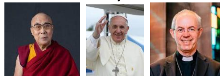
The Dalai Lama, The Pope, The Archbishop of Canterbury