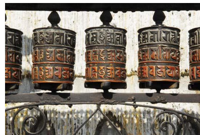
Tibetan Prayer Wheels